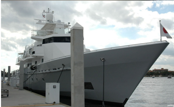
Top: The Harbour Mastery CTO Family sailing out of Boston Bottom: "The Ronin" – Owner – Larry Ellison (from the internet)